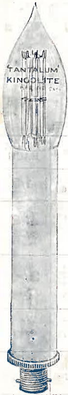
Complete Lamp. (Half Full Size.)