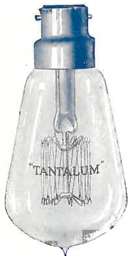
(Half Full Size.) BULB W 2