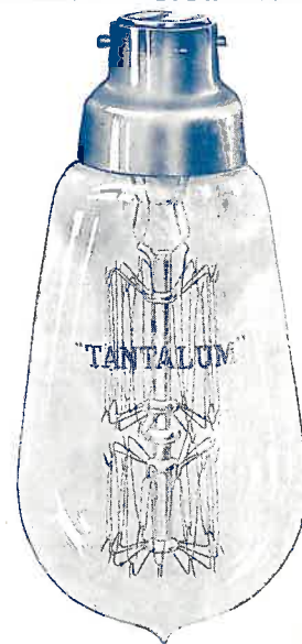
(Half Full Size.) BULB W 3

"TANTALUM" LAMPS are not fragile, and need no special care in handling.