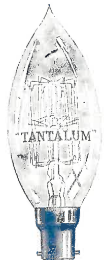
(Half Full Size) BULB K 4

Lamps indicated by Light Type are recommended for Direct Current Circuits only, For Bulb Dimensions see page 4. Unless otherwise ordered, Lamps Capped Small Bayonet (S.B.C.) will be supplied. FILAMENTS OF WIRE DRAWN FROM THE SOLID BLOCK.