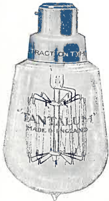
(Half Full Size). BULB N 2