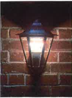
Mazda Low Energy is ideal for security lighting.

example. Why take the risk of climbing up and down a ladder eight times in a dangerous position like that when you can fit a Mazda Low Energy light and save yourself a lot of trouble, and effort?